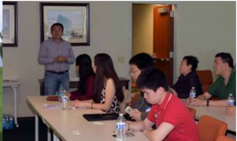
出席华美化学与化工协会/中国旅美专家协会联合学术讲座

American First National Bank Community Service Room, Houston (April 11 th )