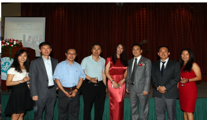
美南浙江同乡会成立晚会 Ocean Palace, Houston (May 24 th )