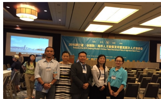
浙江省海外人才政策发布暨高层次人才洽谈会协办方之一 Houston (June 7 th )