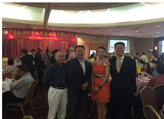
中国人活动中心成立20周年庆祝晚宴 Ocean Palace, Houston (May 16 th )

American First National Bank Community Service Room, Houston (April 11 th )